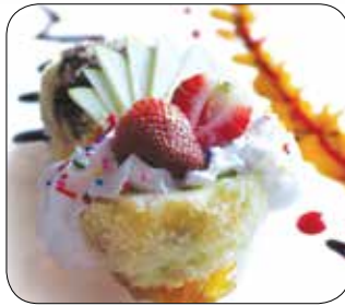
FRIED ICE CREAM $7 Vanilla, Green Tea, Chocolate or Red Bean