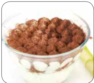
TIRAMISU CUP $10