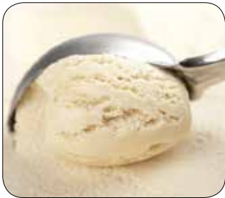
SCOOP OF ICE CREAM $3 Vanilla, Green Tea, Chocolate or Red Bean