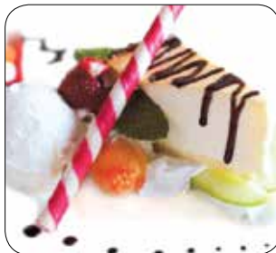
NEW YORK CHEESE CAKE $12 Scoop of Ice Cream (Vanilla, green tea, chocolate or red bean)