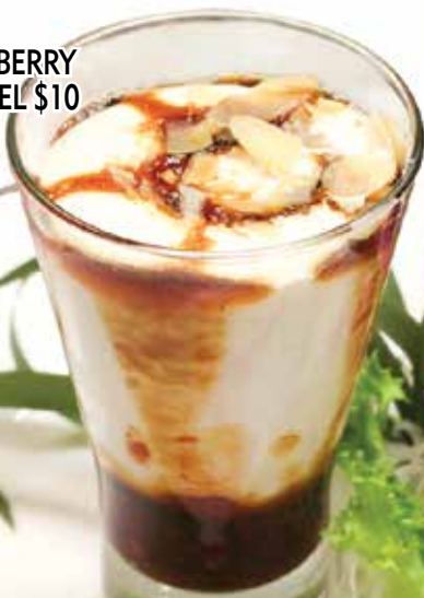
STRAWBERRY CARAMEL $10