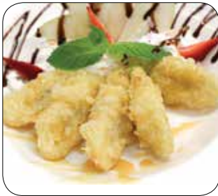
BANANA TEMPURA $6