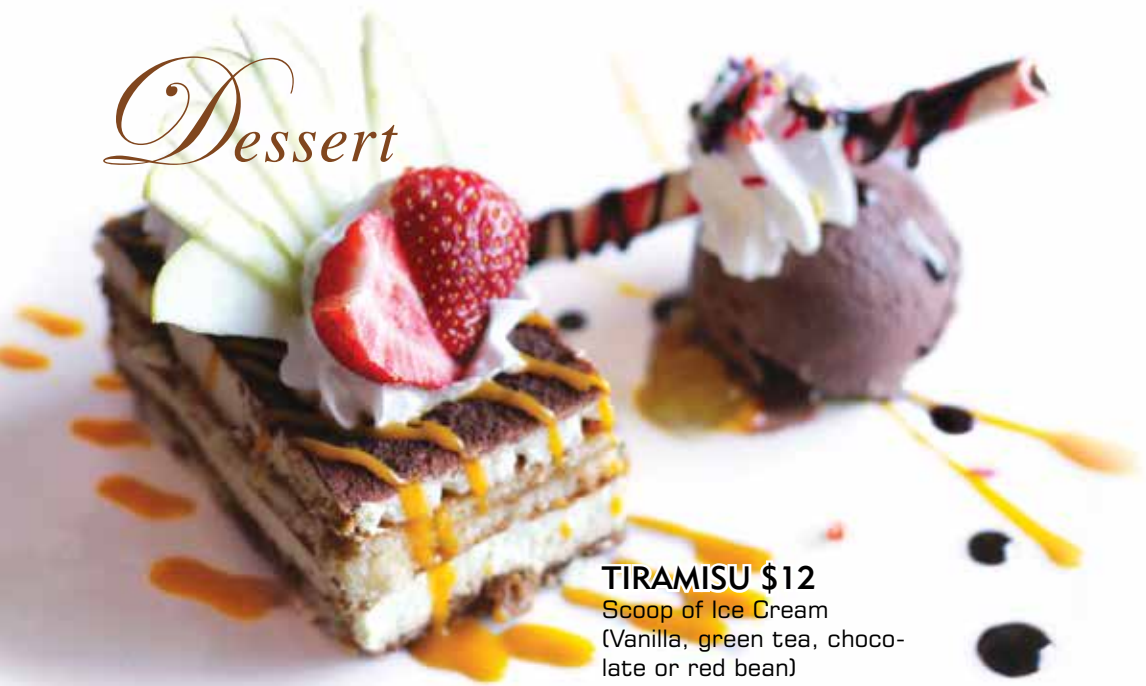
TIRAMISU $12 Scoop of Ice Cream (Vanilla, green tea, chocolate or red bean)