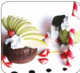
CHOCOLATE SOUFFLE $12 Scoop of Ice Cream (Vanilla, green tea, chocolate or red bean)